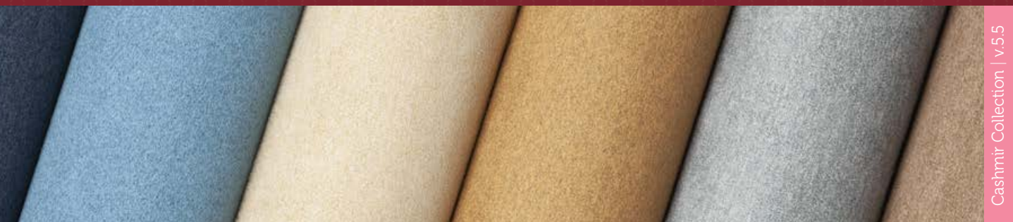
Cashmir Collection | v.5.5

A luxuriously soft fabric for indoor upholstery