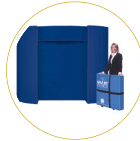
Exhibit/Display* = 80 bottles