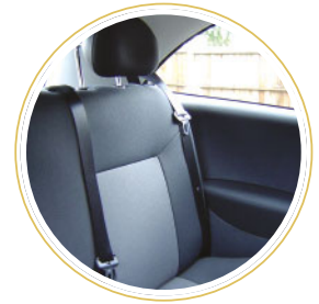
Back Seat of Car* = 90 bottles

Plastic PET containers are picked up at curbside and community recycling centers, and then sorted by type and color.