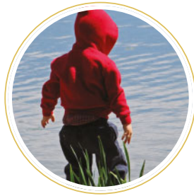
Sweatshirt* = 17 bottles