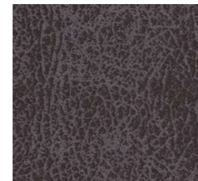
Alberta Hyde Charcoal