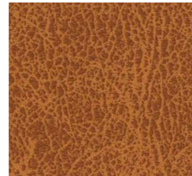
Alberta Hyde Maple

Practical and ideal for any hard wearing environment