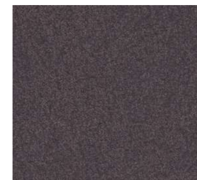
Oregon Hyde Grey