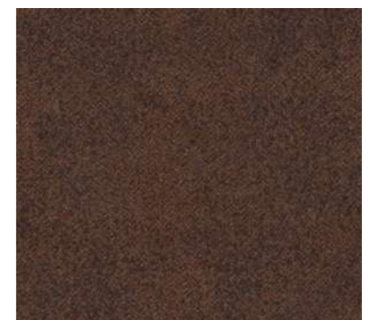
Oregon Hyde Chocolate