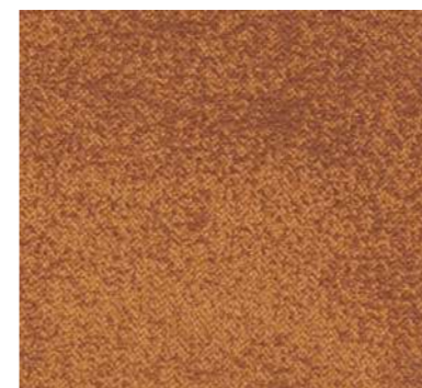
Oregon Hyde Tan