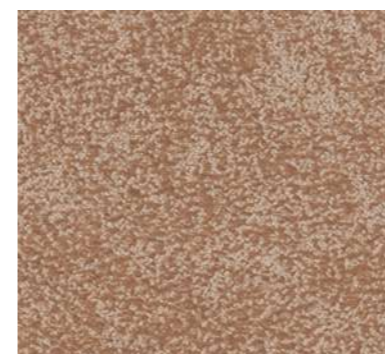
Oregon Hyde Natural