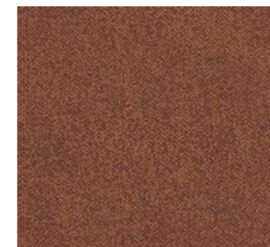
Oregon Hyde Brown