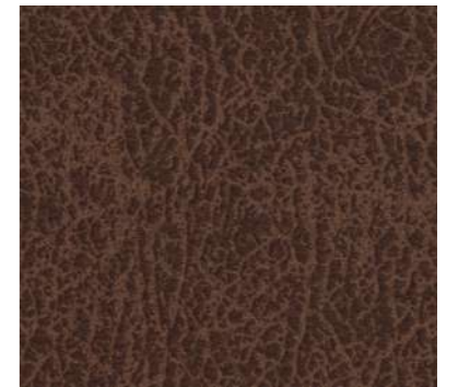
Alberta Hyde Walnut