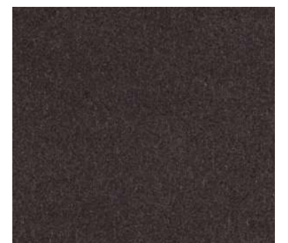
Oregon Hyde Black