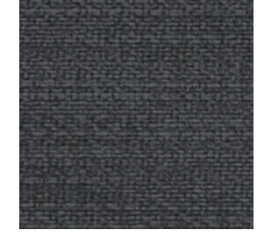
Parody Linen Charcoal