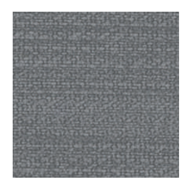
Parody Linen Grey