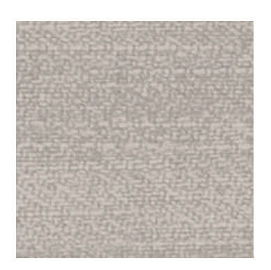
Parody Linen Light Grey