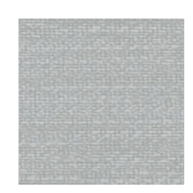
Parody Linen Cloud