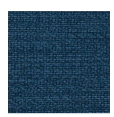
Parody Linen Midnight