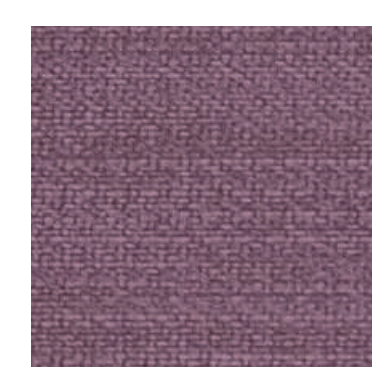
Parody Linen Grape