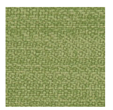
Parody Linen Lime