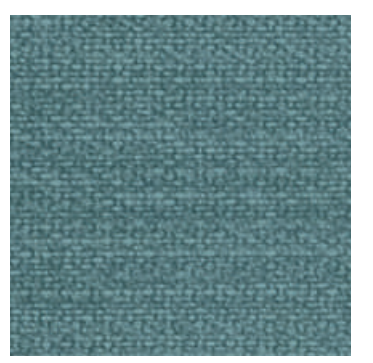
Parody Linen Duck Egg