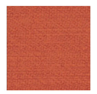
Parody Linen Burnt Orange