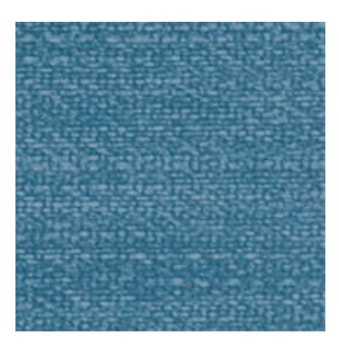
Parody Linen Denim