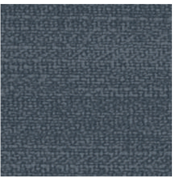
Parody Linen Ink