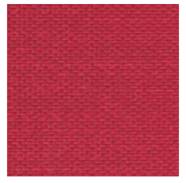
Parody Linen Red