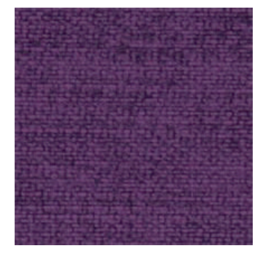
Parody Linen Purple