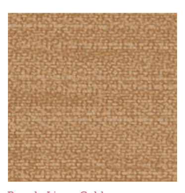
Parody Linen Gold