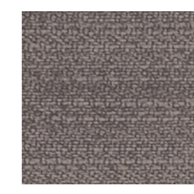
Parody Linen Slate