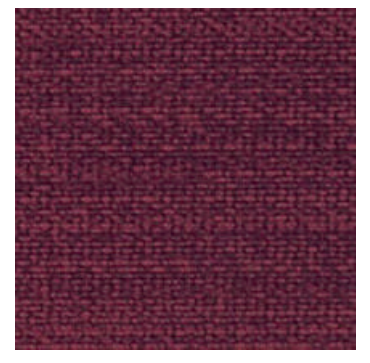
Parody Linen Plum