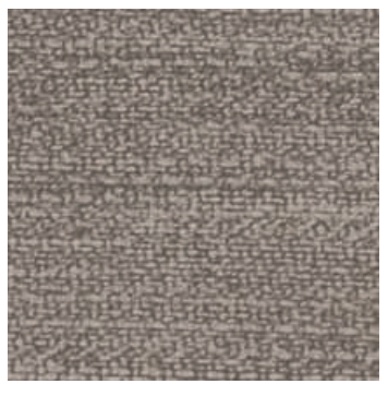
Parody Linen Mink