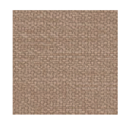
Parody Linen Sand