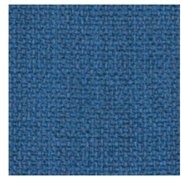
Parody Linen Blue