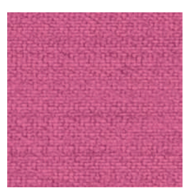
Parody Linen Orchid