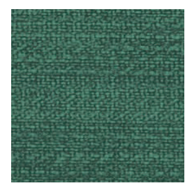
Parody Linen Emerald