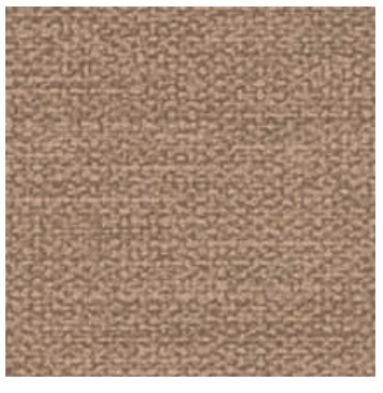
Parody Linen Coffee