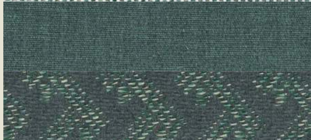
770-04 SPICED GARDAMON