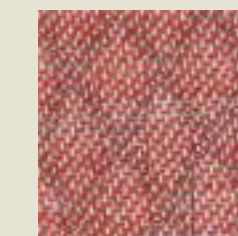
770-38 SPICED CAYENNE