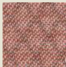
770-37 SPICED CHIPOTLE