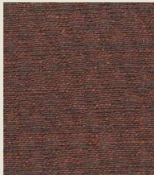
770-07 SPICED PAPRIKA