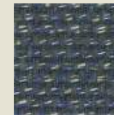
772-02 FLORA BACHELOR'S BUTTON