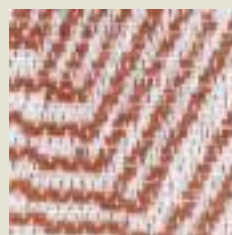
774-37 BOTANIC MAPLE