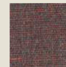
771-08 FJORD RED CLAY