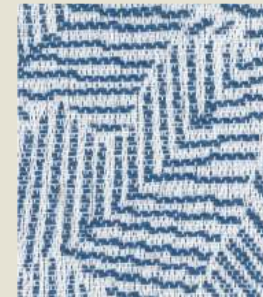
774-39 BOTANIC OCEANUS