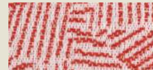
774-38 BOTANIC RUBY