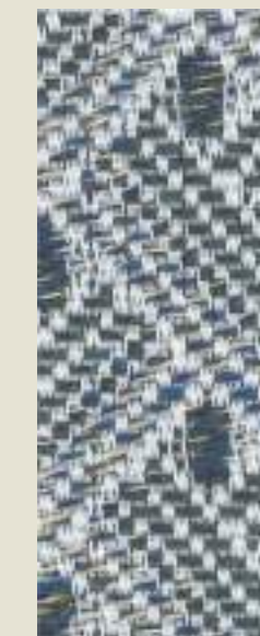
773-34 HORTUS TOPAZ