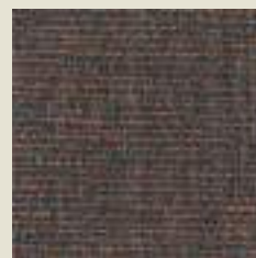
771-07 FJORD AUTUMN LEAF