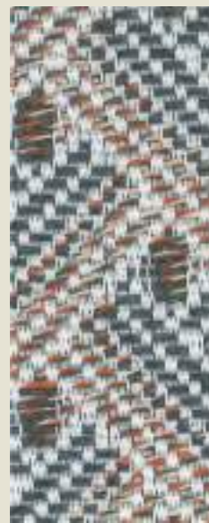
773-30 HORTUS HAZEL