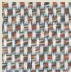
772-32 FLORA BARBERTON