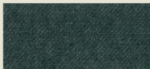
770-05 SPICED TARRAGON