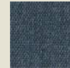
771-09 FJORD OCEAN DENIM