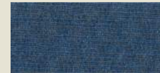
770-09 SPICED JUNIPER