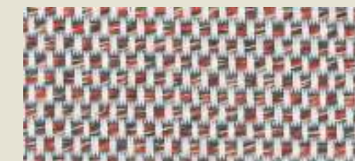
772-35 FLORA ANEMONE