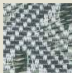
773-31 HORTUS PERIDOT