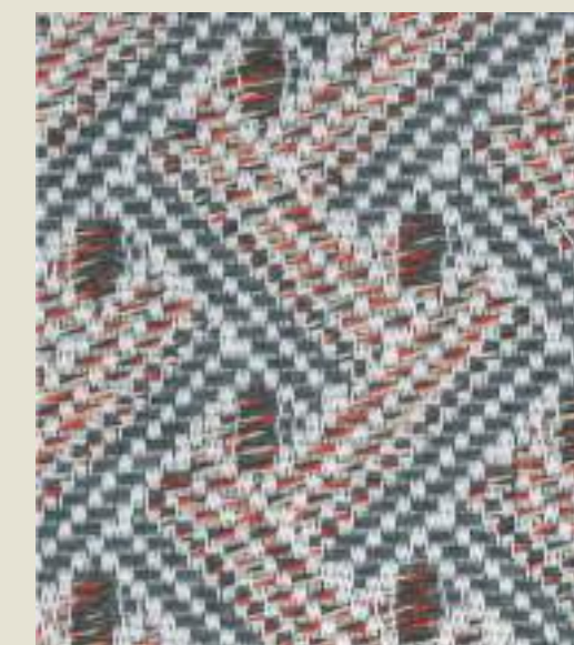
773-36 HORTUS CINNABAR