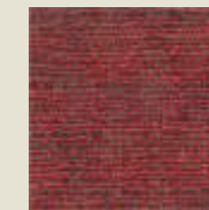
770-08 SPICED CHILI