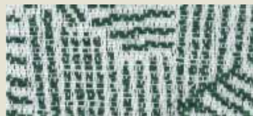
774-35 BOTANIC RAVEN