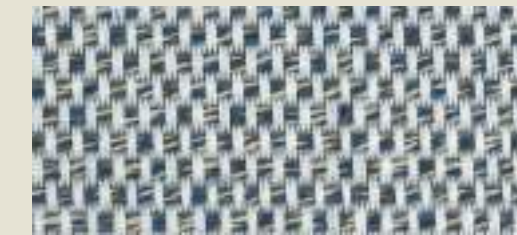
772-36 FLORA FORGET-ME-NOT