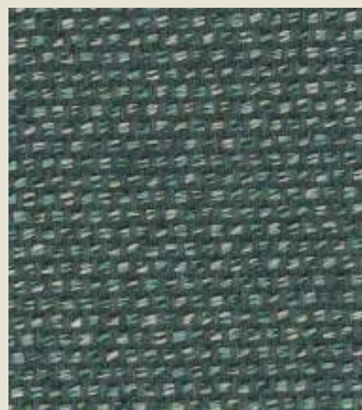
772-06 FLORA PHLOX