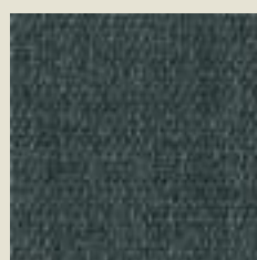
771-05 FJORD LAVA