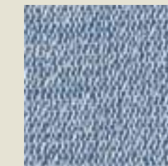
771-39 FJORD WATERFALL