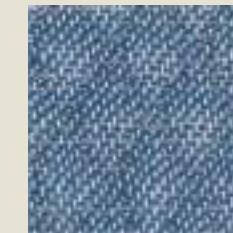
770-39 SPICED BILBERRY