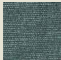
771-04 FJORD LAGOON