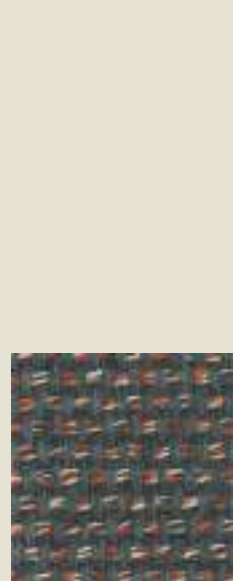
772-03 FLORA HOLLYHOCK