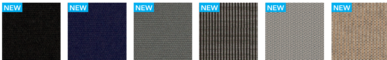
Black SEAM 2095 63 152